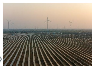
30,000 MW at Khavda, Gujarat