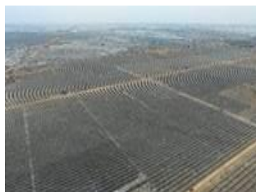
8 MW at Kamuthi, Tamil Nadu

FY16: World's largest single location plant RE project FY23: World's largest single location hybrid RE cluster Next milestone: World's largest solar