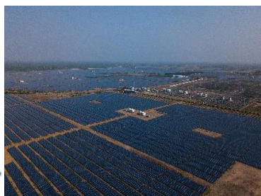
2,140 MW at Jaisalmer, Rajasthan